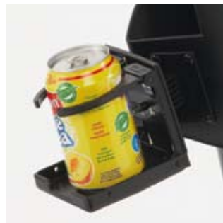
Cup holder Stores a soft drink.