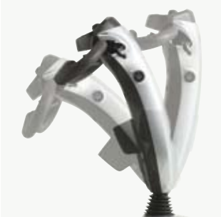
Easily adjust the angle of the tiller