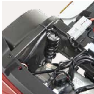
Suspension A fully-suspended chassis provides a comfortable drive at all times.