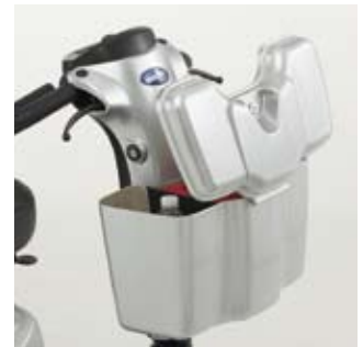
Lockable front box Secure box for personal valuables.