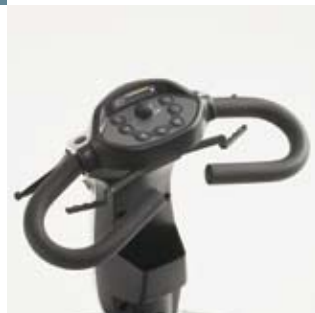
Ergonomic steering Prevents fatigue during long trips.