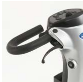
Hand brake Ensures immediate braking if required.