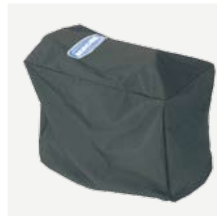
Heavy-duty storage cover Keeps the scooter clean and dry.