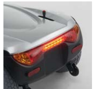
Brake light Heavy duty brake lighting warns people that the scooter is slowing down.