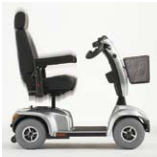
Seat suspension module Adds extra comfort during driving.