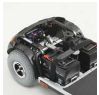
Built-in anti-splash guards Protects electronics and transaxle from dirt and water.