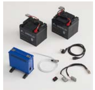
Off-board charging Simply remove batteries to charge with the off-board charger kit.