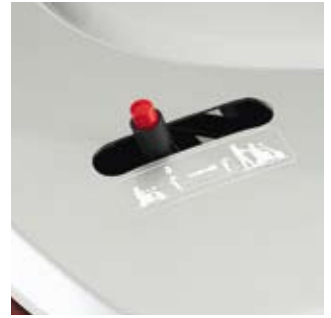
Two-step disengaging lever Prevents the scooter from accidentally free-wheeling.